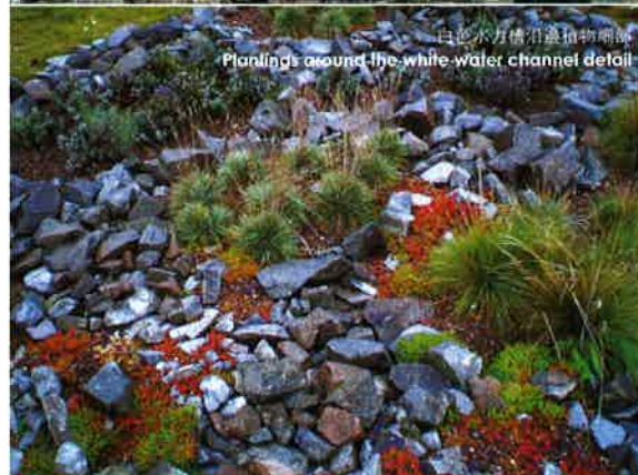
白色水渠周邊植物細節 Plantings around the white water channel detail