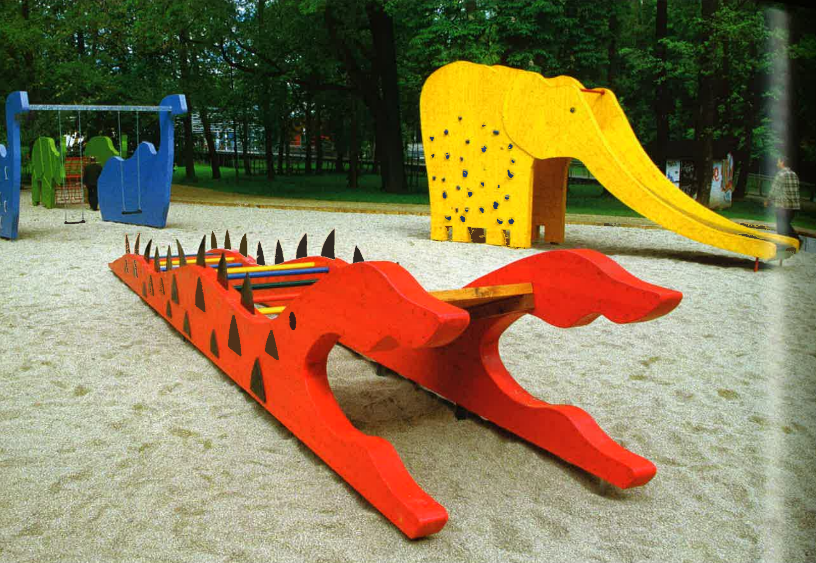
平底船式動物模型游樂器械 (animals of the ark)