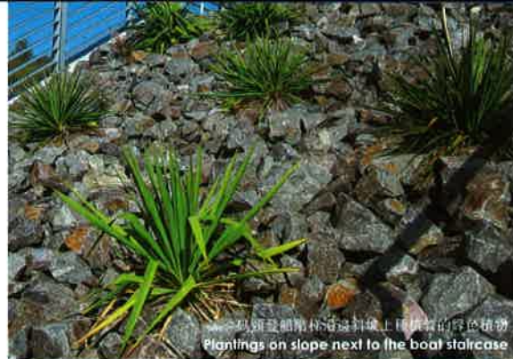
碼頭登船階梯斜坡上種植的綠色植物 Plantings on slope next to the boat staircase