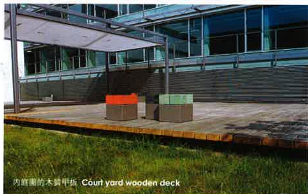
內庭園的木質甲板 Court yard wooden deck