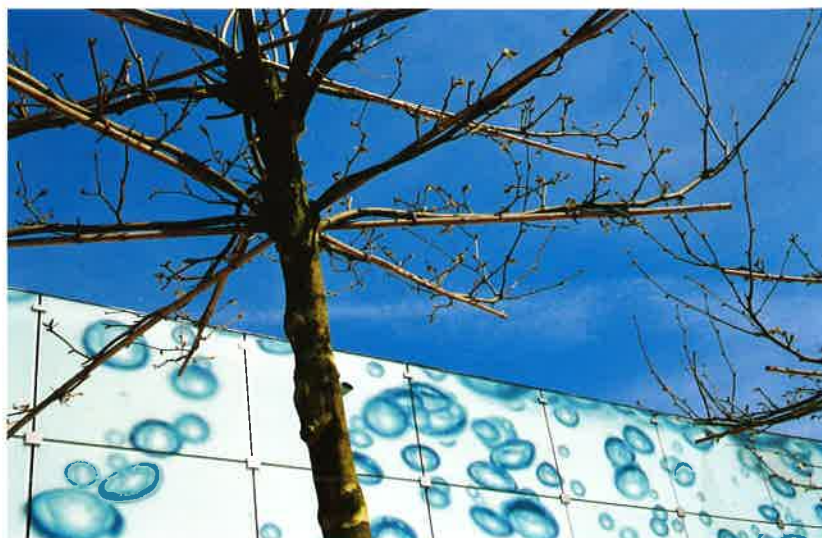
阻水欄柵細部 water bar detail

埃伯斯瓦爾德市區的一處市場廣場經過重新定位與翻修，形成了城市中心的一個多功能開放空間和交通集散點。設計師充分考慮了廣場的地形特征與場地的歷史背景，並將二者有機地融入到了該項目的設計之中。由於這一開放空間地形呈輕微的斜坡狀，它與菲諾隧道形成自然地連接，同時，也有效地在市政大樓與Kreishaus之間形成了一種功能鏈接，該項目的成功之處在於它實現了景觀元素、城市歷史與現代生活三者的完美結合。