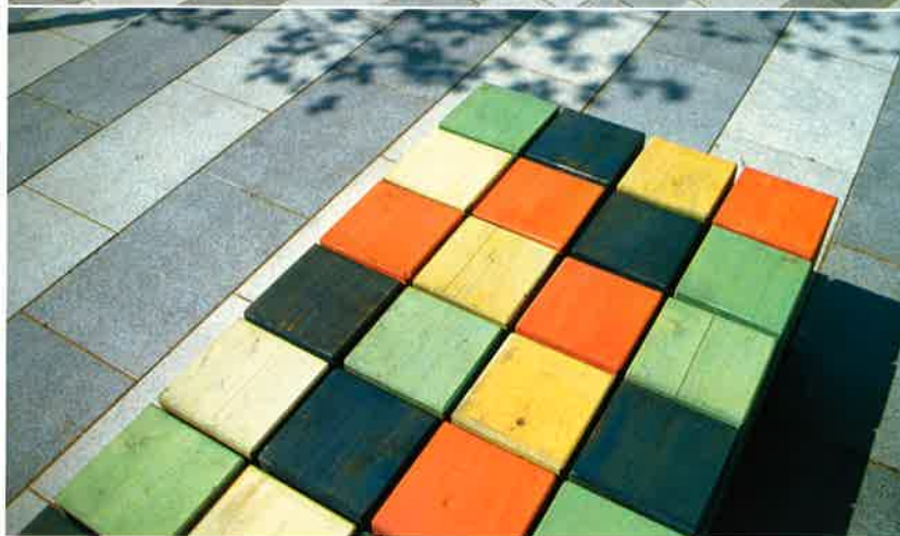
前院裏的彩色長凳 Forecourt bench detail