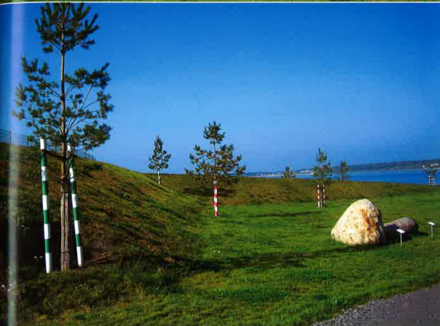
種植于湖畔的松樹 Pine trees along the lakefront