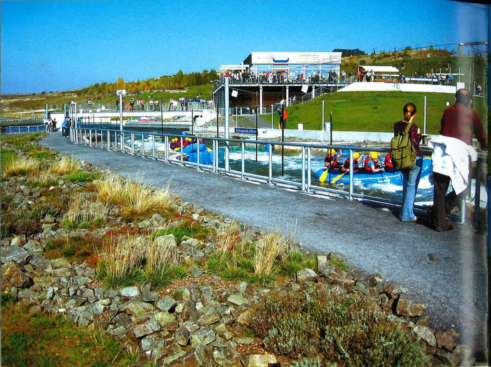
第白色水力槽沿邊種植着許多植物 Plantings around the white water channel