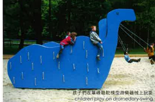
孩子們在單峰駝模型游樂器械上玩耍 children play on dromedary-swing