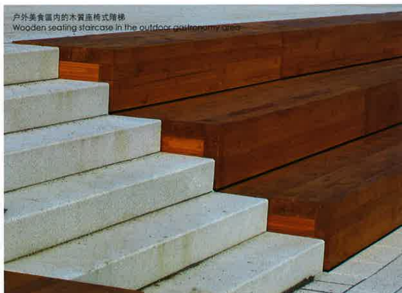
戶外美食區內的木質座椅式階梯 Wooden seating staircase in the outdoor gastronomy area

這裏設有一座運動中心，周圍三面環繞着運動設施區。寬闊的草坪上點綴着一顆顆松樹，將運動中心與周圍的環境和諧地融合在一起。區域內看臺的設計也非常簡潔，並從形態和材料上與周圍的環境進行呼應。在這裏，觀眾可以盡情地欣賞賽事，美麗的馬克萊貝格湖則成了優美的背景。運動區水渠和池塘邊散落的碎石塊，帶來了天然質樸的氣息。