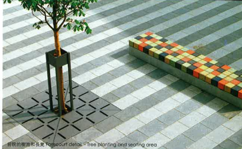
前院的樹池和長凳 Forecourt detail - Tree planting and seating area