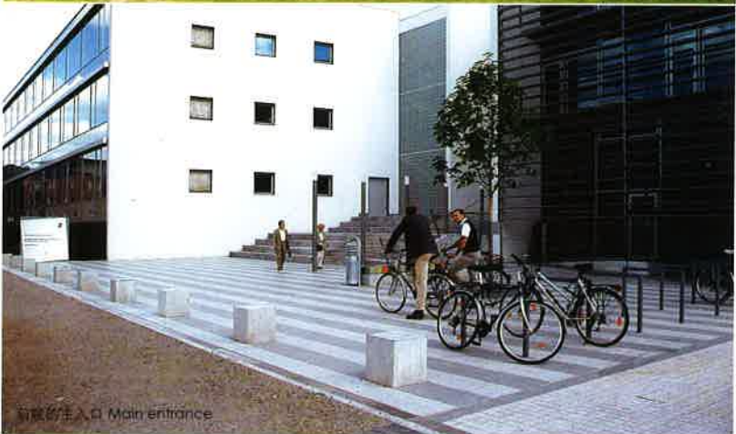
前院的主入口 Main entrance