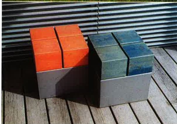
內庭院的兩個矮凳 Court yard 2 stools