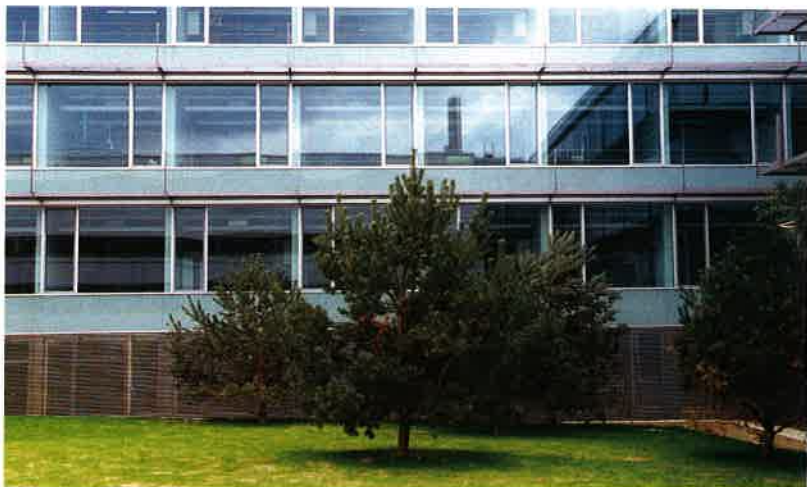
內庭院的松樹和大樓外立面 Court yard pine tree and facade