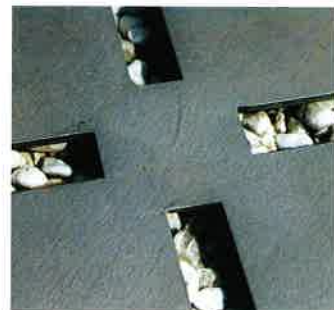
前院的樹池保護格柵 Forecourt tree grid detail

Adjacent to a new Dresden Technical University research building and lecture hall,