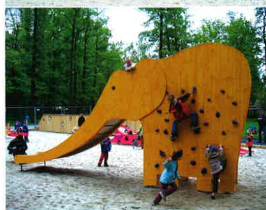
孩子們在大象模型游樂器械上玩耍 children on the elephant-slide2

Right in front of the entrance to the "Tierpark Chemnitz" (Chemnitz Zoo) a new playground has been established. It was intended to generously rearrange the spatial situation in accordance with the zoo's significance for the City of Chemnitz.