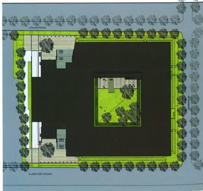
總平面圖 Site plan

與前院的鮮活設計風格相反，矩形的內庭院是處安靜而內斂的空間。沿着南立面而鋪設的大型木質甲板，其多種使用功能還能延伸至鄰近草坪，松樹的深綠色與對面大樓的外立面相呼應，而細部的針狀葉蕨則反襯着近前的釉面玻璃牆，通往地下室的坡道，沿途種植銀草，從而凸顯此區的光影效果。色彩鮮艷的移動方塊坐凳，賦予木質甲板和草坪以靈動的元素。