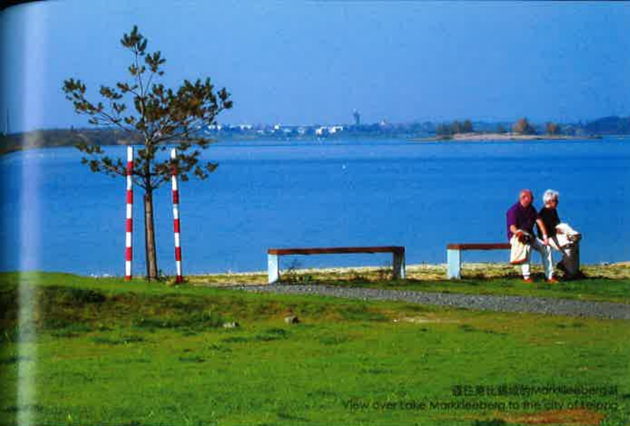
遠望比德羅的Markleeberg湖 View over Lake Markleeberg to the city of Teisnach