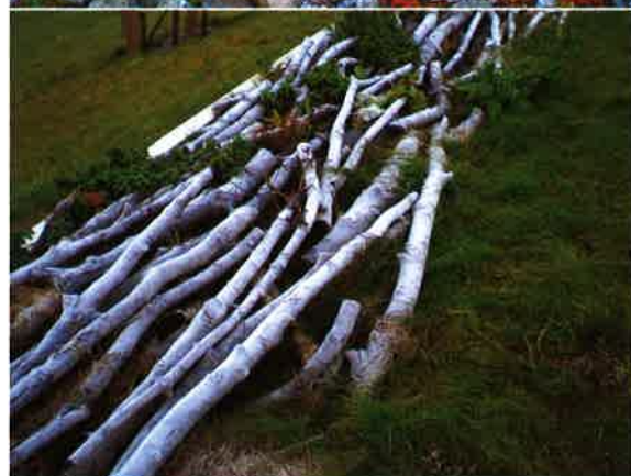
斜坡上的碎石廢木 Ripraps on the slope